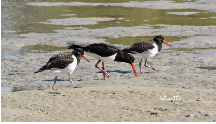
Moona Moona Inlet pied Oystercatcher adult and chicks.