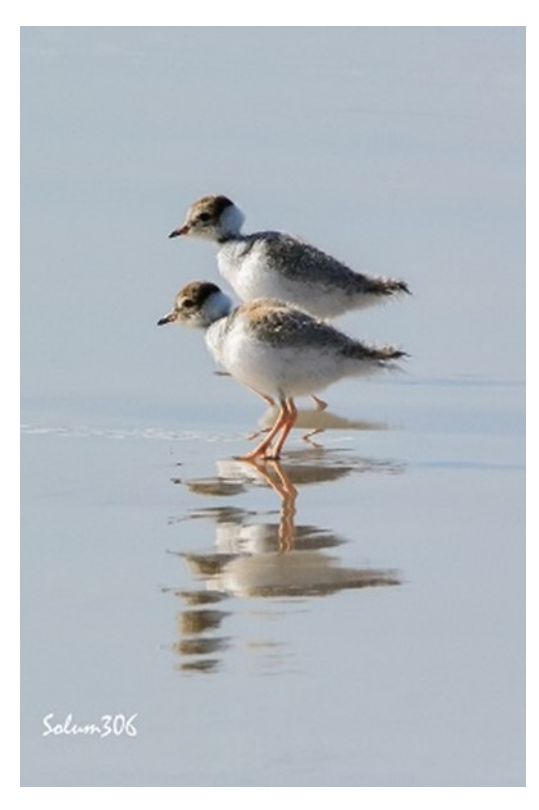
Caves Beach Hooded Plover chicks.

Thank you to everyone who helped with the conservation of our local beach nesting birds - your help is vital to the success of the program. Vanessa.