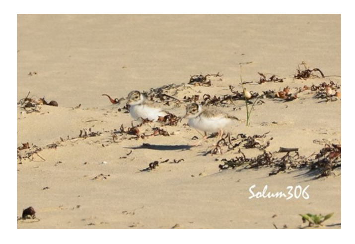
Hooded Plover Chicks.

H7 and M4 were busy early at Island Beach, laying 3 eggs about the 11th of August however these three eggs were inundated during a big swell. The pair moved further south to Dawsons Beach and laid a second clutch of three eggs four weeks later. Three chicks hatched however only one of these survived to fledge with the others lost to unknown causes. This fledgling disappeared soon after it was seen on the 20th November however. It is hoped it was well advanced and had just dispersed from its parents. After the fires, Jackson surveyed the beaches from Pretty Beach to Dawsons to find H7 and M4 with two chicks in early January. The fate of the two chicks is unknown and it is hoped that they survived to fledge. Aside from the remote nature of the site, the success of Hooded Plover chicks at Dawsons Beach may also be partially attributed to fox baiting in the area, with three baits taken in the dunes over a period of 4 months.