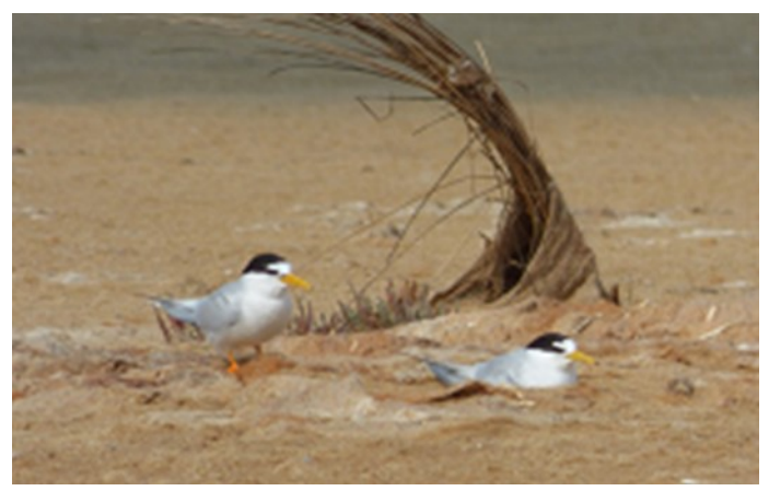
Flagged Little Tern at Lake Wollumboola.

Thankfully, by a stroke of superb luck (or maybe some you-beaut habitat diversity) the Terns nested in the desired southern entrance area without any intervention and by late December, 26 nests were recorded with many beginning to hatch. Although things were looking promising, December 31st was to deal an unexpected blow to the colony as the Currowan fire roared into Conjola, forcing hundreds of locals and tourists in cars and on foot to evacuate to the beach around the colony. Although amidst the chaos people still managed to stay mostly outside of the colony, it is likely that the high stress situation may have caused the abandonment of a number of the nests. Following this, it appears that predation by a fox also affected the colony however, due to the nature of the fire situation and the aftermath, monitoring was unable to be conducted reliably for approximately 2 weeks and so most losses were unaccounted for. When monitoring did resume late in the season, two fledglings were seen on the 25 January by Col and Neal. This was down to one fledgling observed by volunteers amongst the flock prior to the Terns leaving on their migration in mid-February. Hopefully, next year will see an improvement in nesting success at an important South Coast Little Tern colony.