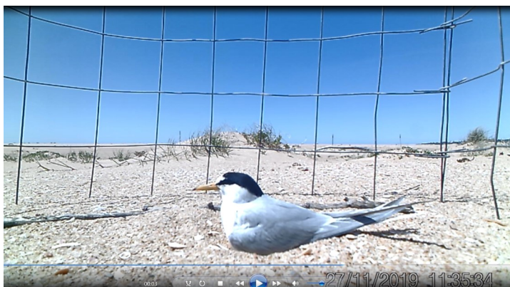
Photo below left: Cameras placed on nest cages at Mogareeka. Right: Nest cage at Mogareeka and a new volunteer.

'Dogs prohibited' protection has been removed from some parts of Mogareeka inlet, and changed to 'dogs on leash'. We have made a submission to BVSC highlighting the impacts on resident and migratory shorebirds and will update volunteers on any changes.