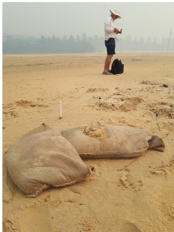
Photo above: Smoke from bushfires at Tuross and raised nests. Bill, one of the Tuross volunteers braving the adverse summer conditions: Credit: Sophie Hall-Aspland

No school educational events were held over summer, but a few early season community events were attended with the shorebird education trailer. Shorebird volunteers were also taken on a field trip to Montague Island.