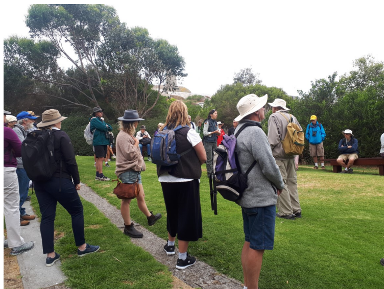
Photos clockwise from top left: Bingie Bounce Back Day, Broulee Art on the Path. Montague Island Shorebird volunteer field trip.

Thanks for helping with the Far South Coast NPWS Threatened Shorebird Recovery Program