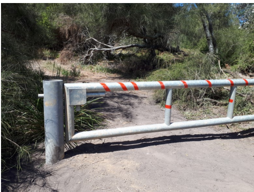
Photo Left: New gate installed at Bullengella by Eurobodalla Shire Council. Right: Dogs on leash sign being trialled where dogs and sign removal is a problem.

The pair at Bullengella Beach (S2+p) laid 3 eggs, however all eggs were taken by a resident fox. Another nesting attempt produced 2 chicks, one of which fledged and the other was presumed to be lost to foxes. Fox control was conducted at adjacent private properties and removed a number of foxes. Again, we had trouble with vehicles on the beach until Council installed a gate, which defied even the strongest 4WD. Our 'dogs prohibited' signs were being removed as soon as they were installed. We then trialled 'dogs on leash' signs, which were relatively successful and remained in place for the duration of the season. Some people with dogs kept to the low water mark showing they were relatively effective.