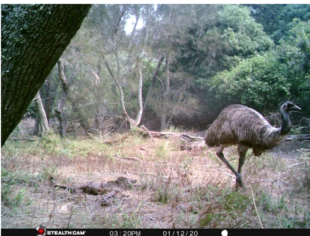
Top Left: Visiting kangaroo caught on camera. Top right: Finally the fox is spotted at 4:07am but with a bandicoot in its mouth. Bottom left: visiting emu.